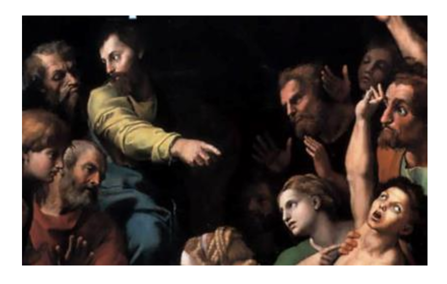
Detail: man pointing at the obsessed youth

Well, once we join forces, and by "we" I mean the fourth generation of cultural psychiatry scholars, I'm sure that understanding the influence of the religious factor in the psychic processes will not seem such a huge goal to achieve